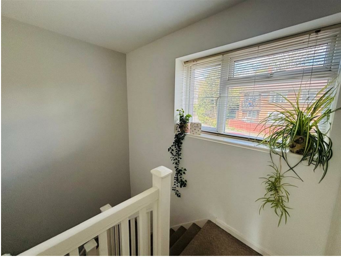
Double glazed window, access to the first floor accommodation & loft space