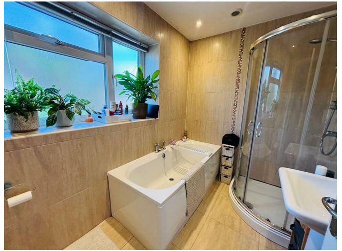
Double glazed window, a suite comprising of a panelled bath, a glazed shower cubicle with a plumbed shower above, low flush WC, wash basin, ladder style central heating radiator