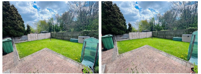
The front garden is block paved, low maintenance & mainly designated to off street parking. The rear garden is a good size & has a lawn as well as being fully enclosed.