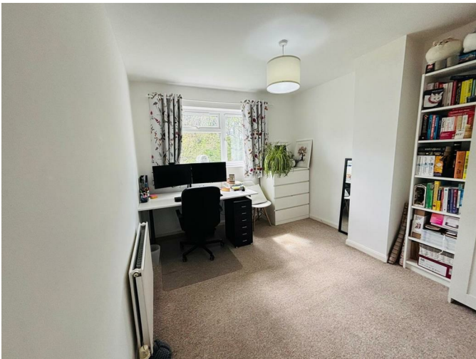
Double glazed window, central heating radiator, ample space for bedroom furniture