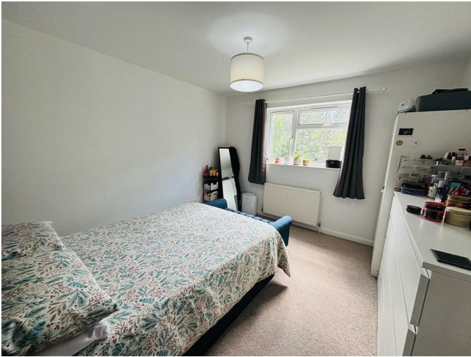
Double glazed window, central heating radiator, ample space for bedroom furniture